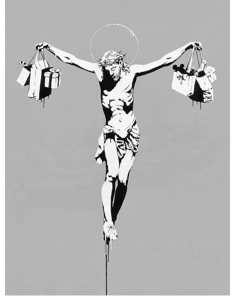
Figure 1. Consumption Christ, The artist: Robert Banksy, dimensions, 50x70 cm, The materials: Silk cloth on paper, Date: 2004, Tate Gallery / London.

Banksy is a famous and English graphite artist, and unknown in the same time, where he believed his name Robert Banksy, born in 1974 and his origin from the town of Yet, near Bristol. However, there is no confirmation of the true Banksy identity and his autobiography remains unknown. His paintings appeared in many locations in England, especially in Bristol and London city (Dickens, 2019). In this work (Figure 1), the artist depicts the famous iconic figure of Jesus in the poignant steel scene where he was suspended between the sky and the earth, his arms stretched to the sides, his head resting on his left shoulder, while the artist depicts the legs of Christ to the limits of his knees where the colors flowed down to the bottom of the painting in a way that simulates the scene of blood flowing from the amputee. Liquid blood droplets also appear along the arms and down the neck, and the head of Christ is surrounded by a round halo with droplets of color hanging in a vacuum without a cross, tried from his hands shopping bags that are popular in the stores and appear from it gifts, candy and drinking bottles, while appearing on the other side of Mickey